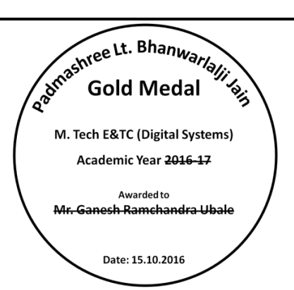
Back side of PG Gold Medal