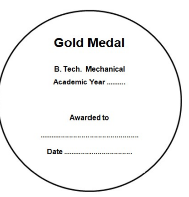
Back side of UG Gold Medal (Mech)