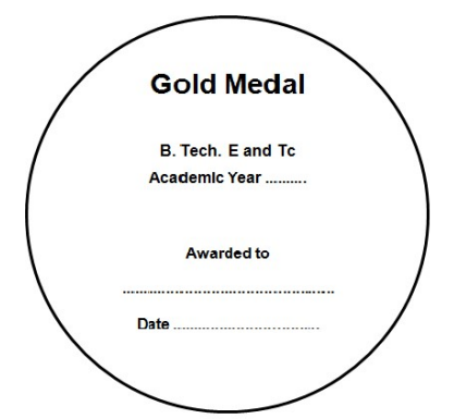
Back side of UG Gold Medal (E & Tc)