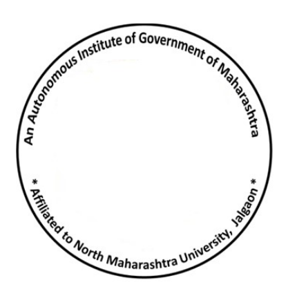
19 or 20 grams Silver Coin for Gold Medals (On front side of all Gold Medals)